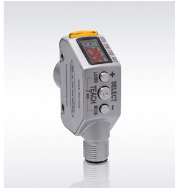
IO-Link facilitates parameterization of the laser distance sensor Q4X at hard to reach places

Using the "Application Specific Tag" each uprox3 IO-Link sensor can be individually identified